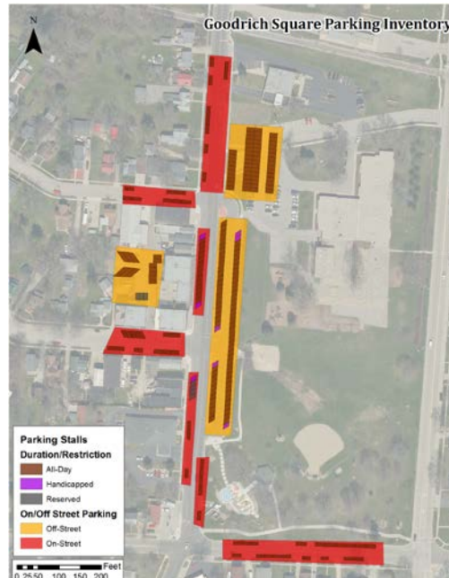
Figure 2. Goodrich Square Parking Inventory